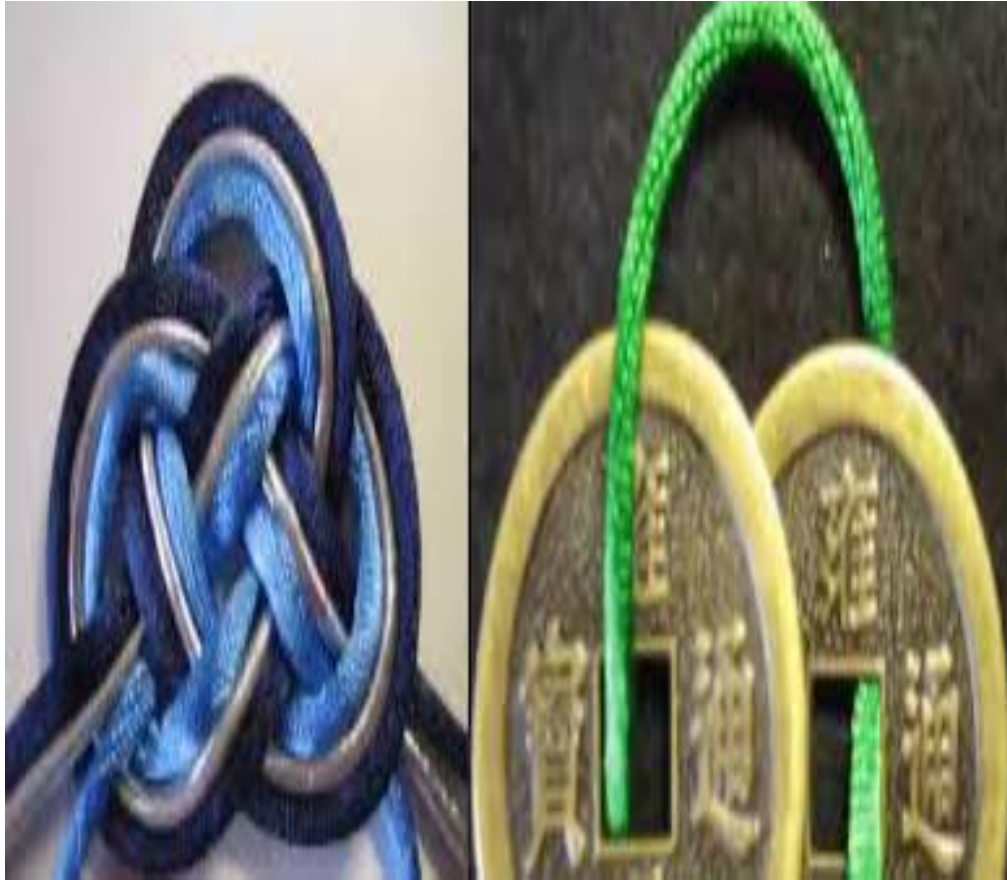
Copper Cash Knot (Money Knot or Double Gold Wire Knot)